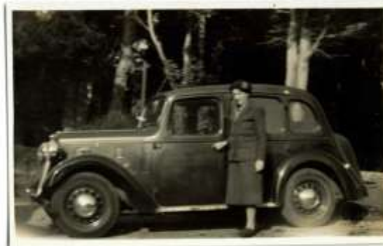
Figure 3 - Hazel Pinder in front of her car in Milford-on-Sea.

The badges and beret were all owned by a Miss Hazel Pinder of Milford-on-Sea, who served in the WVS during the war. It was originally founded in 1938 and formed to help recruit women into the ARP. By 1943, there were over a million volunteers that carried out duties such as: first aid, collecting salvage, assisting civilians during and after an air-raid and even the evacuation of children. There were various branches in the New Forest.