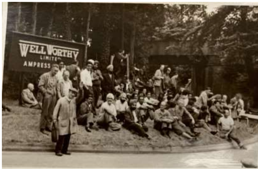
Figure 1 - Employees outside Wellworthy Factory

This exhibition and accompanying information will show what the Home Front experience in the New Forest during WW2 was like. Civil defence was an important aspect of the Home Front, the varied objects chosen will help in providing a narrative of the different defence organisations during the war and how they evolved after. Air Raid Precautions (ARP changed to Civil Defence Service in 1941), Women's Voluntary Service (WVS) and the later Civil Defence Corps will be looked at. WW2 affected everyone, and everyone had their part to play in the war effort, from civil defence, factory work, to even agriculture. This exhibition highlights part of the important work of the New Forest Home Front at this time.