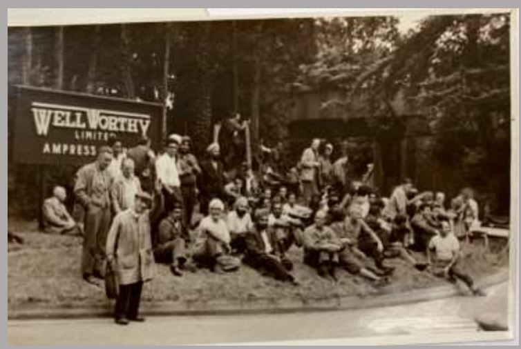
Figure 1 - A photo showing employees outside the Ampress Wellworthy factory, which was important during wartime.

Forest's coastline. Twelve airfields were also built in preparation for D-Day.