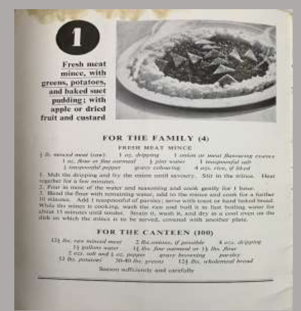
Figure 9 - Ration Dinners booklet, offering meal suggestions based on rationing. 1941.

Rationing was a prominent side effect of the war. There were large shortages of food supplies and resources as a result of the reduced number of imported products. This meant that the policy of rationing was introduced to conserve as much as possible. Booklets which helped families plan their shopping and meals for the week began cropping up. These offered advice and meal ideas based off of the rations available.