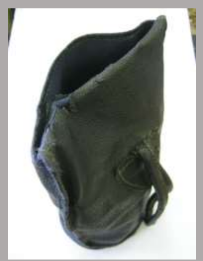
Figure 8 - An adult gas mask, which came in a brown cardboard box.

While Civil Defence and other volunteer organisations were an important aspect of the Home Front during WW2, there are other key avenues to look at. Daily life was greatly affected, where the population had to become accustomed to new rules and regulations like never before. The New Forest was no different. Gas masks, which became symbolic in many ways to what wartime life was like, were issued across the area. More than 10,000 were given to people in the New Forest initially. Eventually, everyone was carrying their own mask, where a total of 38 million were issued nationwide.