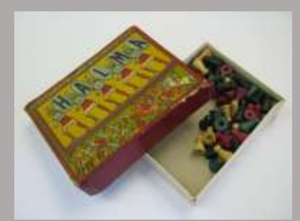
Figure 5 - Pieces of the board game 'Halma,' used for civil defence training.

ARP training took place in the New Forest all throughout the spring and summer of 1939, where there was a mock air raid on Lymington in June and a trial black-out across the whole of Southern England on 9 August. As mentioned in the exhibition, Lt Col James Edmond was an ARP Head Warden at this time. He used a white sheet, black tape, pieces from a 'Halma' board game, alongside other small pieces to make a map of Lymington for training purposes.